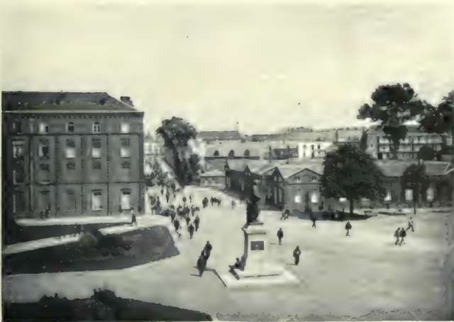
LEAVING THE WORKS FOR DINNER.

operations which the "pigs" of crude iron undergo from the time they reach the works until, transformed into a thousand different products, they are sent off again, by means of a siding, quite recently made, which directly connects the works with the railway.